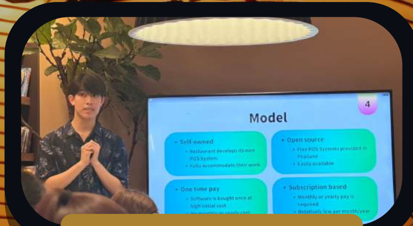
Showcase Ideas to Industry Leaders CEOs