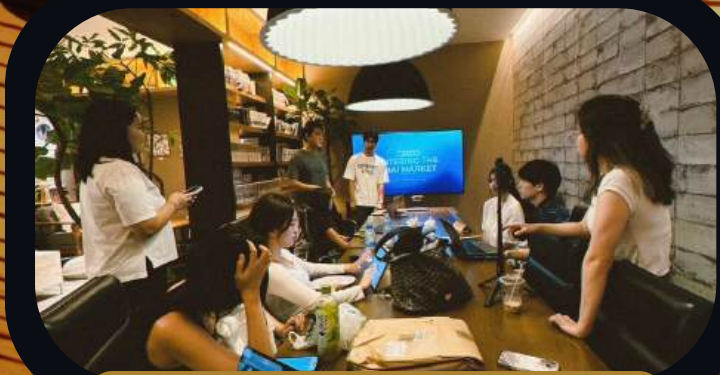
Collaborative Work Hours