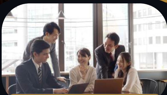
hosting company Office